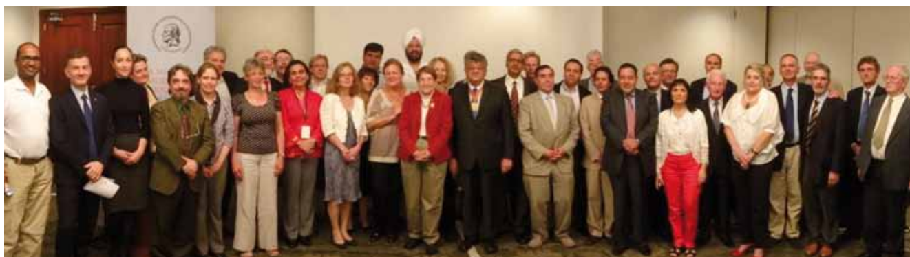
Participants of the IC Meeting 2013