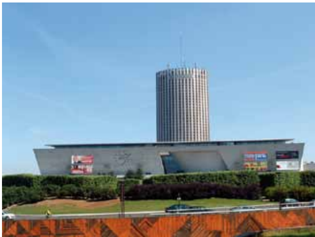
Palais des Congrès, Paris

We rely on all of you for carrying on this debate and continuing to open the horizon of the future.