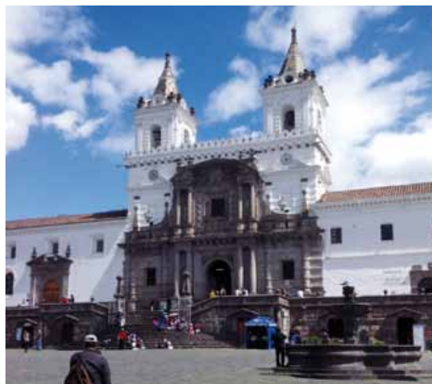
Church and convent in Quito