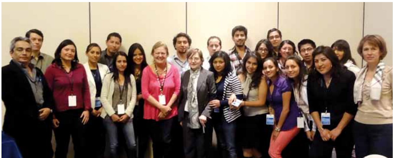
Participants of Pharmacy Session

It was a beautiful experience in which I hope to have the opportunity to participate again.