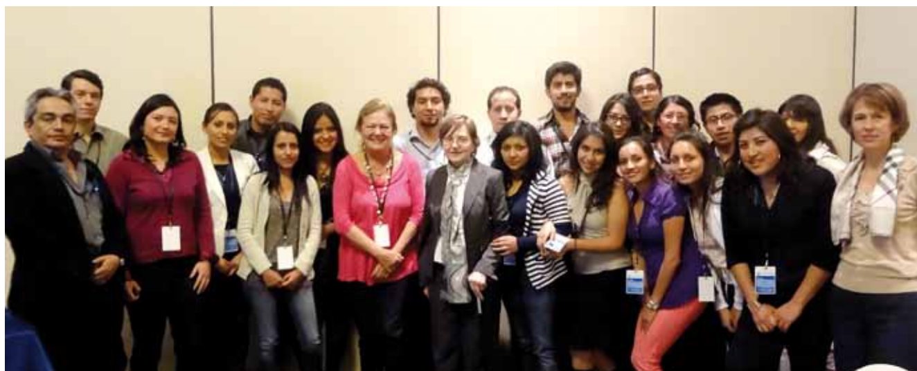
Participants of Pharmacy Session

It was a beautiful experience in which I hope to have the opportunity to participate again.