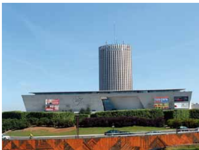
Palais des Congrès, Paris

We rely on all of you for carrying on this debate and continuing to open the horizon of the future.