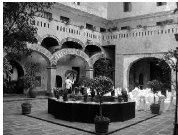
Courtyard, Historic Camino Real Puebla, site of Dinner Dance

The Congress concluded and there was a picturesque and exciting Dinner and Dance at the Camino Real Hotel, one of the most historic and artistic hotels in the Historic Center of Puebla. Awards and gifts were given to the many people who made this Congress a great success. The band was very lively and colorful and everybody seemed to have a good time.