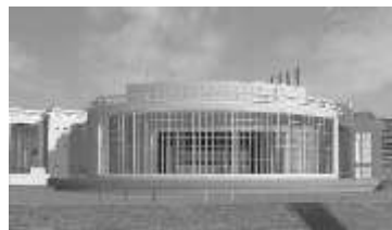
Kursaal, Oostende, Belgium, site of the 63 rd Liga Congress