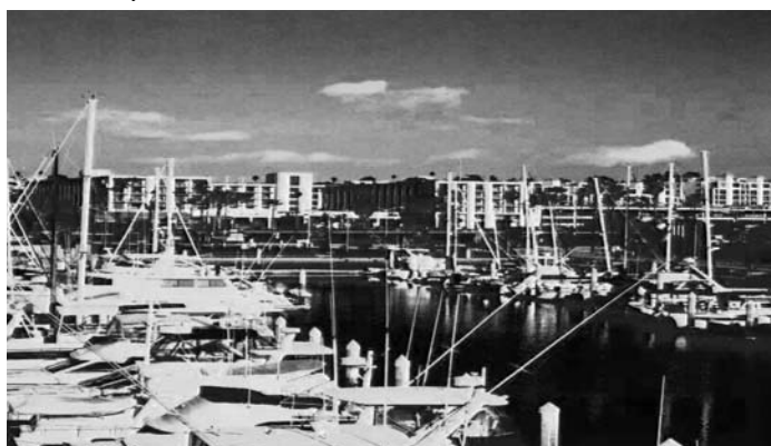
Crowne Plaza, site of 65 th LMHI Congress

A sub-theme is that of celebrating the 200 th Anniversary of the Organon of Medicine written by Samuel Hahnemann. This, of course, has a sense of the Past . In other words, this 65 th Congress wants to honor the past and emphasize the marvelous ideals of Hahnemann, but also simultaneously emphasized the Present and Future . Of course, Truth is timeless, but as the old Hispanic saying goes: “La Verdad no se casa con Nadie” or Truth is not married to anyone . One must hold to your ideals until a legitimate truth requires one to have the courage and wisdom to change. The original Organon , Sixth Edition, with Hahnemann’s handwriting, is presently in San Francisco in the University and will, hopefully, be transferred to the Los Angeles area for this special 200 th anniversary.