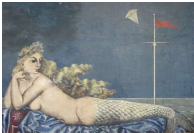
Delveaux Original Wallpainting at the Congress site

Modesto Roca delivered a well-written report on 16 cases of Prolactinomas