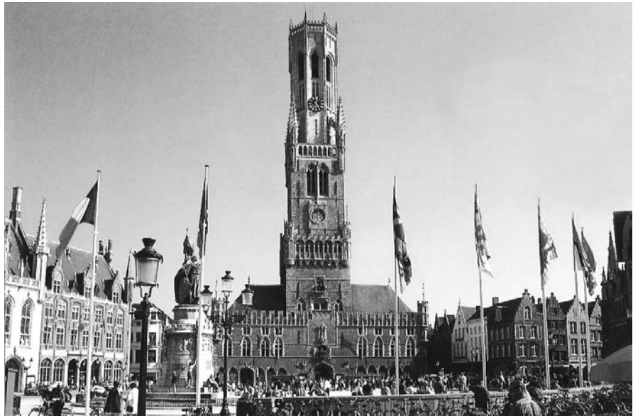
Belfy Tower, Bruges

The day was well climaxed by a dinner and dance in the city of Bruges at the Belfy. This historic, majestic stone building with high ceilings and arched rafters overlooking canals allows one's imagination to return to the Middle Ages and