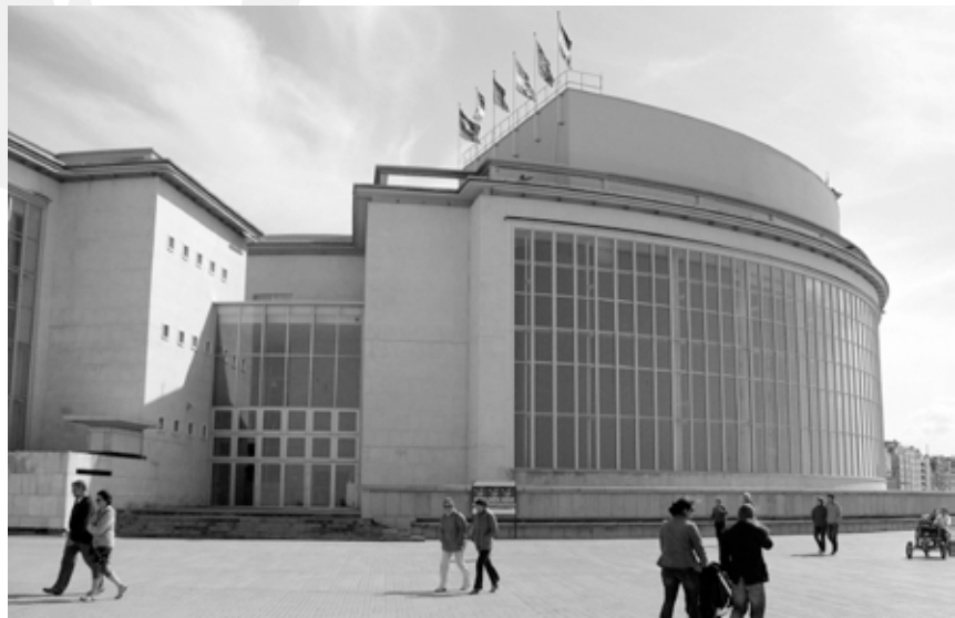
Kursaal Auditorium, site of 63rd LMHI Congress

It was a breezy, cool and sunny day for the North Sea ocean view opening session of the 63 rd Congress of the Liga Medicorum Homeopathica Internationalis in the Kursaal Auditorium. Oostende is known as the Queen of the seaside resorts with wonderful sandy beaches and a first-class harbor and yacht basin.