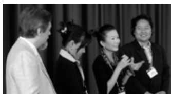
Representatives from Thailand speak at the IC Meeting about their plan to introduce homeopathy into their country.

Representatives from Thailand and Moldavia invited to make a presentation at the International Council Meeting.