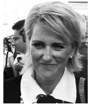
H. M. Queen Paola of Belgium