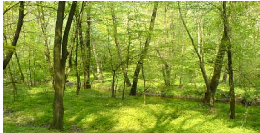
Forest nature reserve Grady nad Moszczenica, Poland